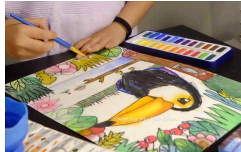
Toucan painting, by my student