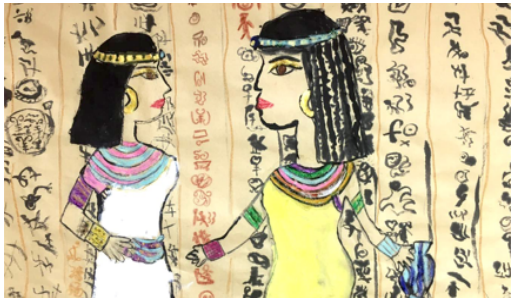
The funny Egypt mural, by my students